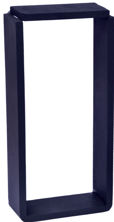
WallMax® Rectangular Metal Frame Openable (WRFO)