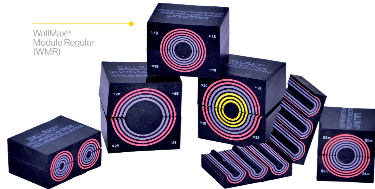
WallMax® Module Regular (WMR)

WallMax® Multicolor Regular Modules allow for quick, easy installation. Combining modules with single and multiple openings maximises the utilisation of packing space within a frame.