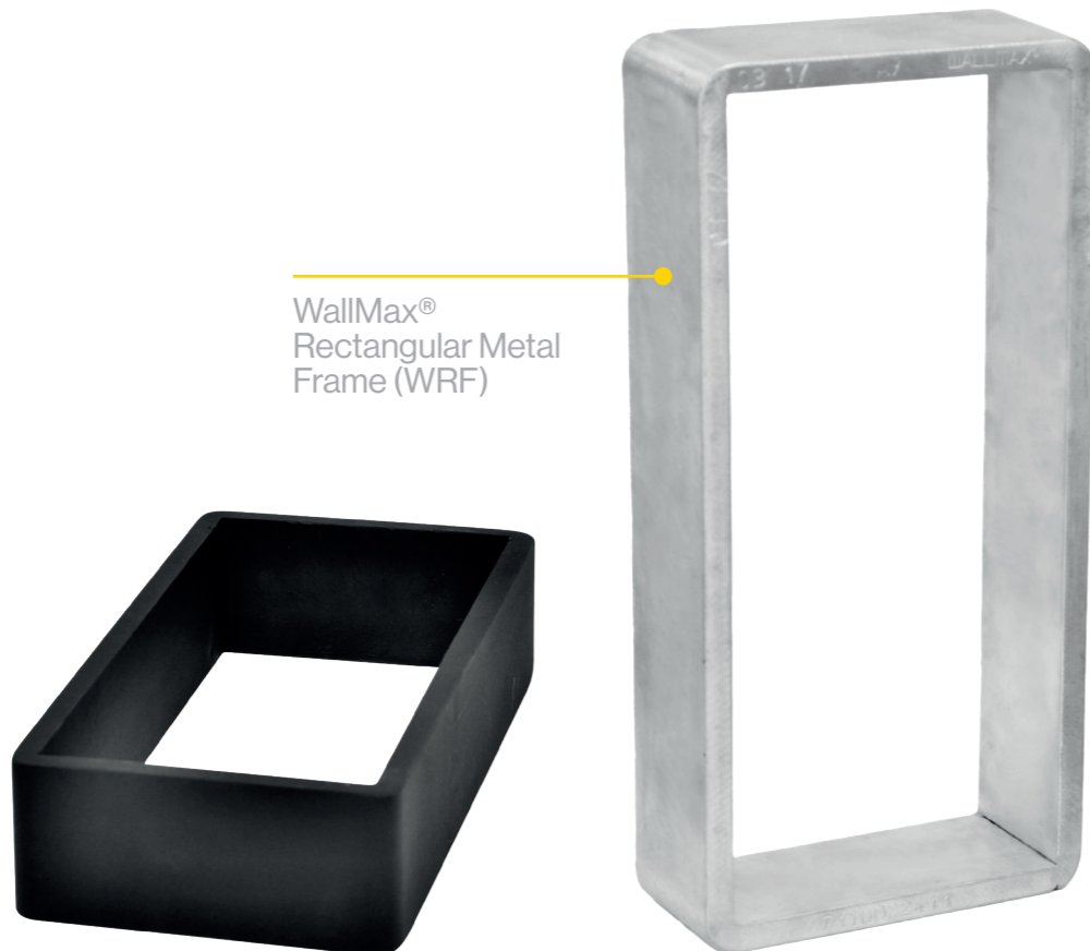
WallMax® Rectangular Metal Frame (WRF)